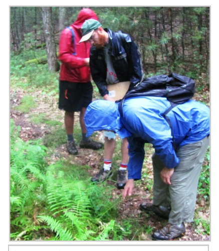
Searching for and identifying Japanese stiltgrass along Jerry's Run Trail.

No more than 4 NNIP species were observed in any single segment. Geographically, the area where NNIP were most frequently observed was the southern extent of Ramsey's Draft and the trail that borders it. In addition, the two parking and trailhead areas – Mountain