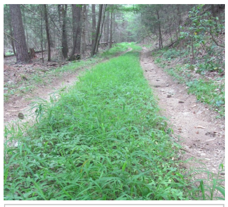
Japanese stiltgrass and coltsfoot are abundant on the Sinclair Hollow road below Shenandoah Mountain Trail.

some of the more common NNIP of the region. This project was the first organized effort to document NNIP in any of the GWNF's six wilderness areas.