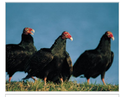
Turkey Vultures (Cathartes aura)

avoids picking up bacteria when it sticks its head inside a carcass while feeding. The feet of Turkey Vultures are weak and resemble chicken feet. An elevated hind toe and blunt talons allow them to walk more easily and to hold their food in place as they eat. Long and broad wings allow the Turkey Vulture to glide almost effortlessly for hours.